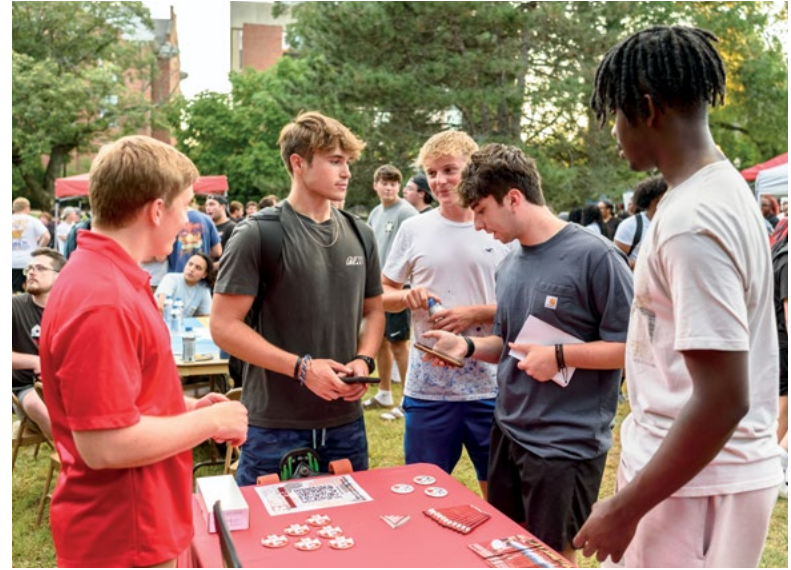
IFC chapter members meeting students who are interested in joining during an event on the Quad.