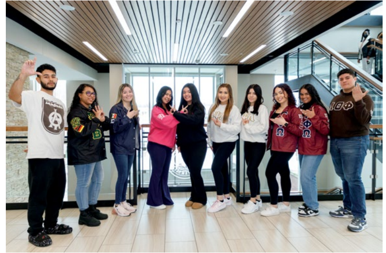
Members of the United Greek Council participated in the SFL Leadership Retreat.