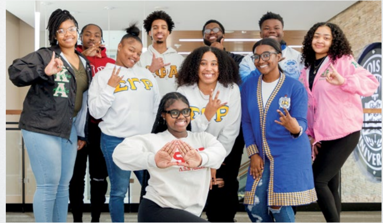
NPHC fraternity and sorority members throwing their hand signs.

After the University's stance on sororities and fraternities was reversed in 1969, several organizations formed on campus including, Tau Kappa Epsilon Fraternity, Lambda Chi Alpha Fraternity, and Delta Sigma Theta Sorority, Inc. The initial community consisted of 12 fraternities and eight sororities and has grown to 41 chapters with approximately 1,900 members today. The administrative unit supporting these organizations is named