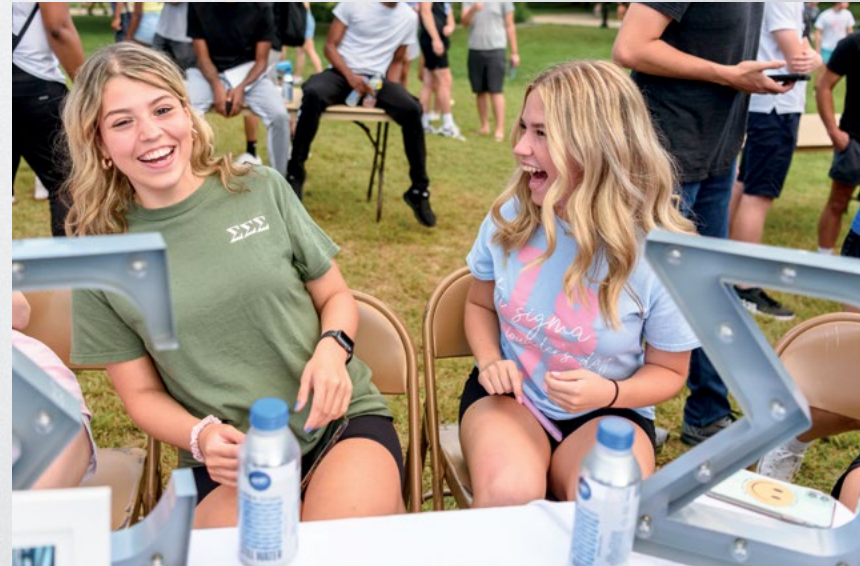
Members of Tri-Sigma working a tabling event on the quad.