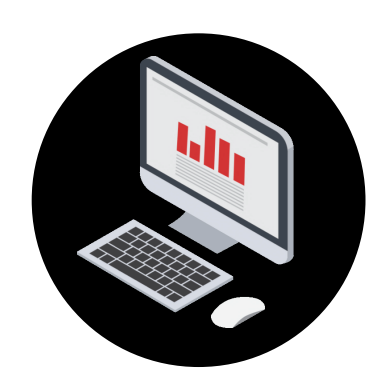
Located: 225 Bone Student Center